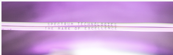
ABOVE: UV Laser Marked Wire

At its heart the Nova 50-100i incorporates a new laser marking module. This employs a high pulse rate, air-cooled, diode pumped UV solid state laser, coupled with a two axis galvanometric scanning system that directly writes the required characters onto the surface of the wire.