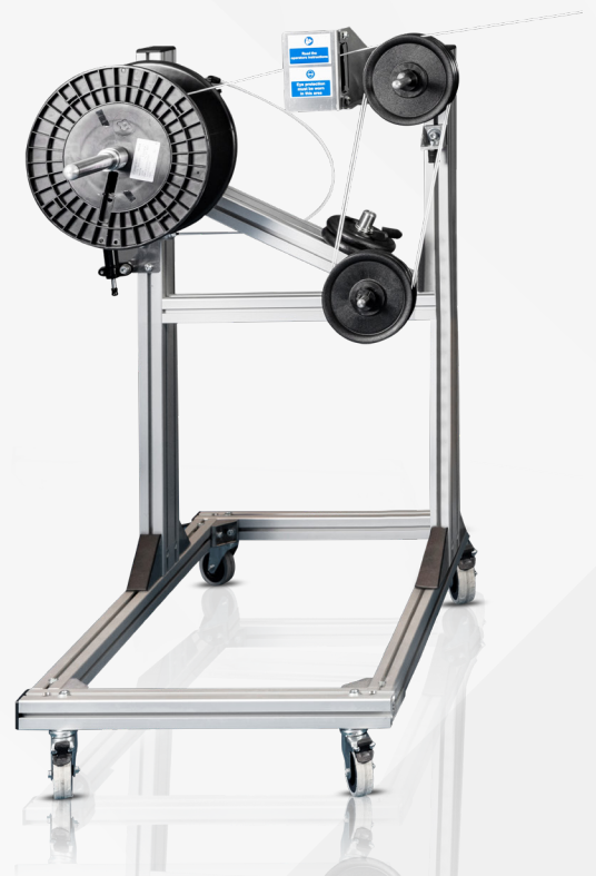
ABOVE: Single Floor Standing Unpowered Dereeler

The Nova 50-100i has been designed for both ease of use and maintenance. Hinged doors and easy access panels provide quick access to all parts of the machine. Alignment of the laser beam to the wire for set up and maintenance is undertaken simply via the PC in Class 1 laser mode. No flash lamps or water filters to change - the new long life diode packs are rated for 20,000 hours operation.