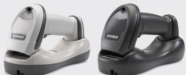
ABOVE: Linear Barcode Machine Readable Codes