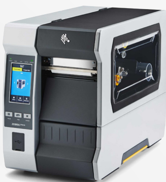
ABOVE: Zebra Label Printer