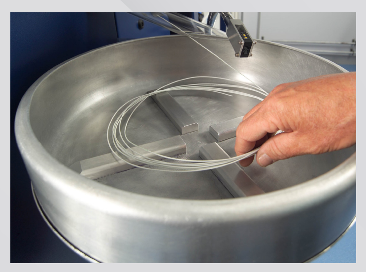
above: coil pan with coil pan sensor

Coil pans are the standard method of collecting wires and cables after marking, measuring and cutting to length. A coil pan sensor is also available as an option. This passes a light beam across the pan so that as the operator reaches into the pan to remove the processed segment the system will automatically start producing the next segment, thereby minimising delays and maximising productivity. Coil pans are provided as standard on all systems unless downstream automation systems are selected.